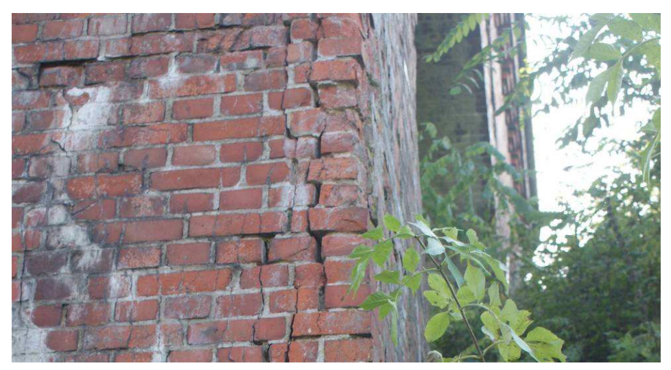
Fig. 7. View of viaduct pillar B. Visible cutting of the outer layer of bricks

Additional degradation of described bridge structures will result in more aggressive development of vegetation. For example, the tracks are already covered by several-years-old trees and shrubs.