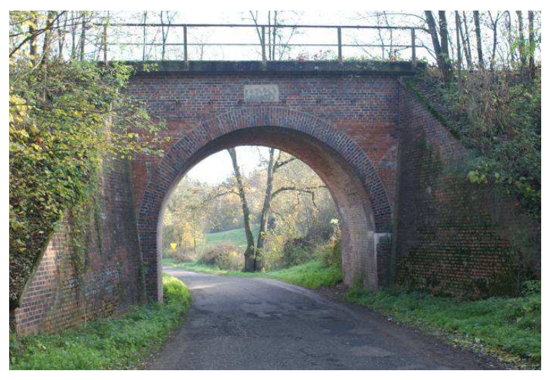
Fig. 5. General view of the bridge D

The object D is a one-span viaduct, the smallest of the described (Fig. 5). Under the object runs westwards the local paved road from to the village of Nojewa to Kikowo. On both sides of the bridge, parallel to the road, on the length of more than 8 m, there are retaining walls restricting the ground scarps. In the early 60's building was undergoing a complete renovation during which fragments of vaultings, clinker bricks on the edges of the arches were renewed and one made a reinforced concrete bridging slab with a thickness of approx. 25 cm.