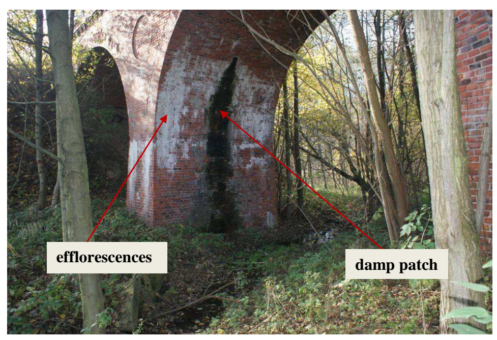
Fig. 6. View of the degradation of bridge object "A"