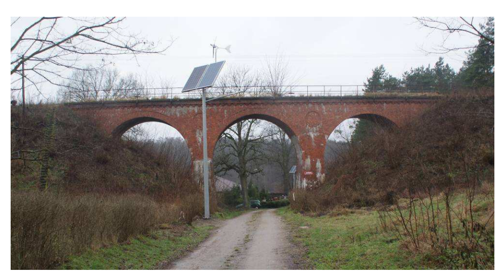
Rys. 3. General view of the viaduct B