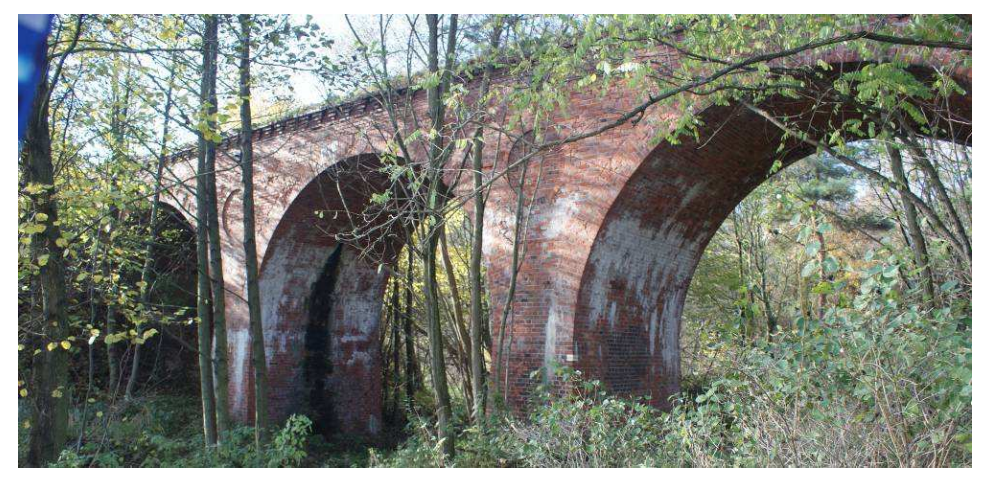
Fig. 2. General view of the bridge structure A

All arched bridges were made of full ceramic brick. The object marked with A is a viaduct, it composes of four arched spans up to approx. 8 m each (Fig. 2). Under the second span is a dirt road and under the third runs a small stream.