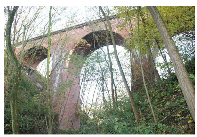
Fig. 4. General view of the bridge C

The object D is a one-span viaduct, the smallest of the described (Fig. 5). Under the object runs westwards the local paved road from to the village of Nojewa to Kikowo. On both sides of the bridge, parallel to the road, on the length of more than 8 m, there are retaining walls restricting the ground scarps. In the early 60's building was undergoing a complete renovation during which fragments of vaultings, clinker bricks on the edges of the arches were renewed and one made a reinforced concrete bridging slab with a thickness of approx. 25 cm.